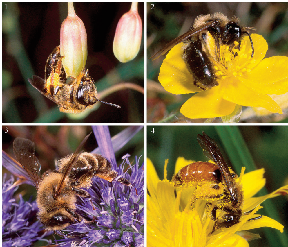
Fig. 1: Andrena chrysopus on Asparagus officinalis . Rabotnica, May 2009.